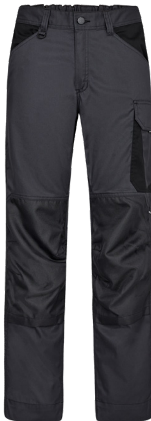
7920 Anthracite Grey/Black