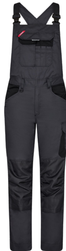
2079 Black/Anthracite Grey