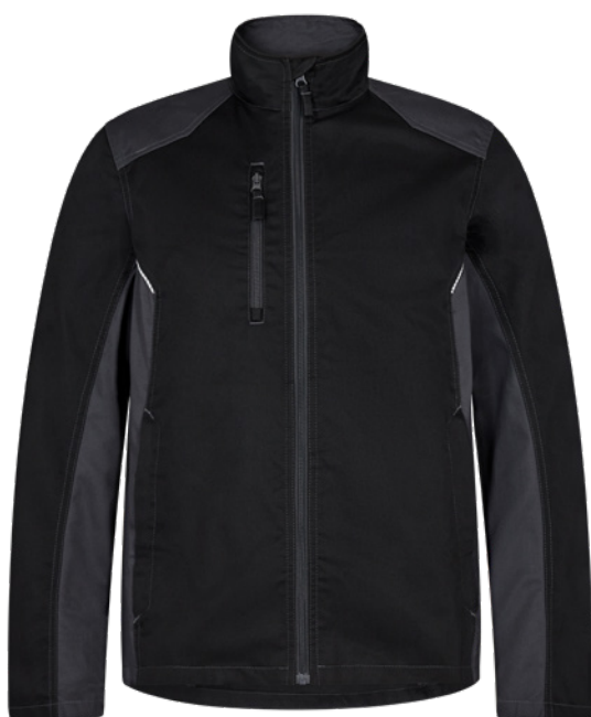
2079 Black/Anthracite Grey