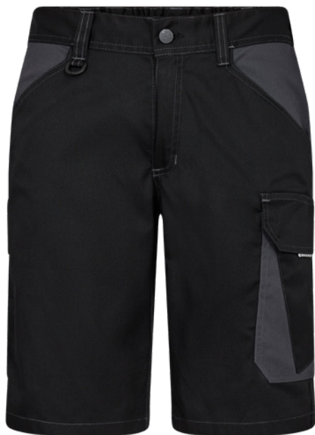
2079 Black/Anthracite Grey