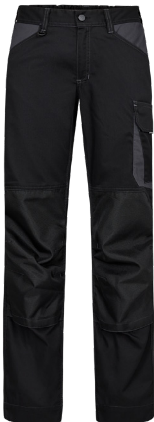
2079 Black/Anthracite Grey