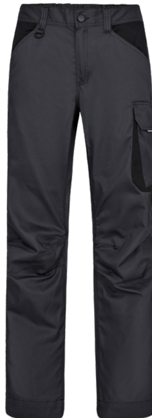
7920 Anthracite Grey/Black