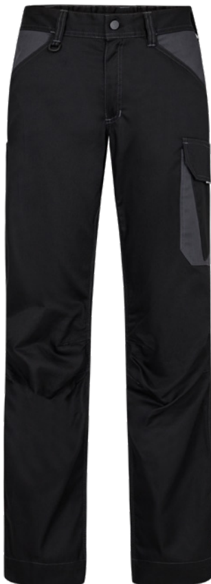
2079 Black/Anthracite Grey