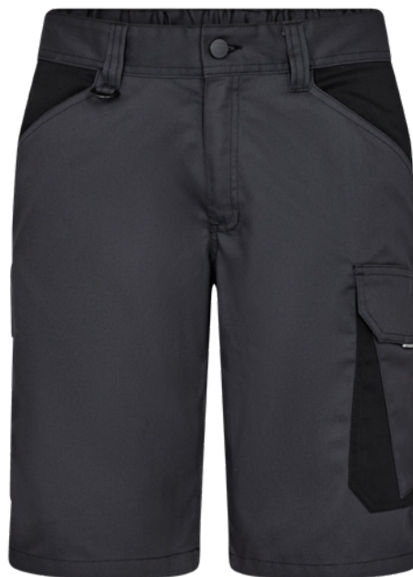
7920 Anthracite Grey/Black