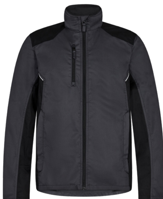
7920 Anthracite Grey/Black